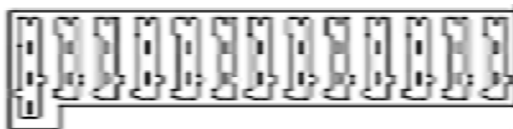
2019-2021 "Star" Connector